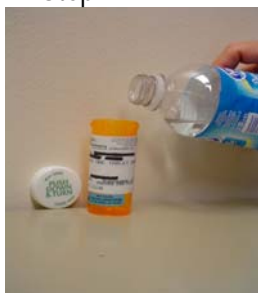
Mix with water and coffee grinds, cat litter, or dirt