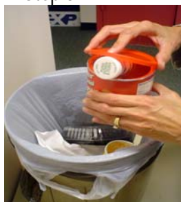
Place in opaque container