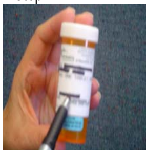
Mark out personal information